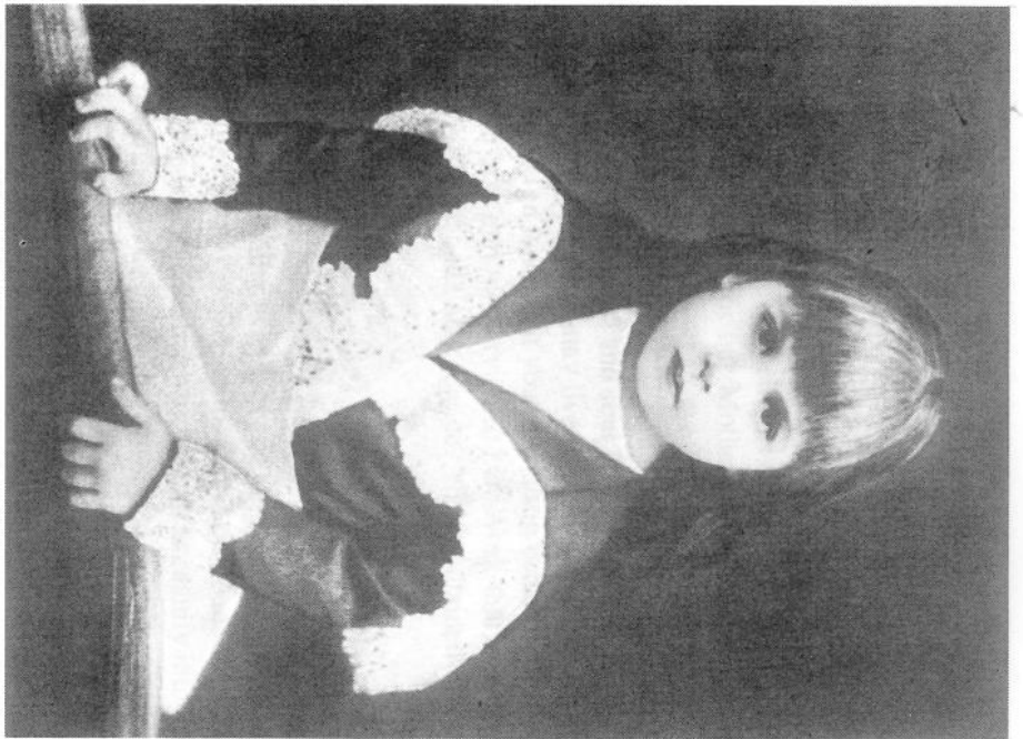
The Mother at the age of seven