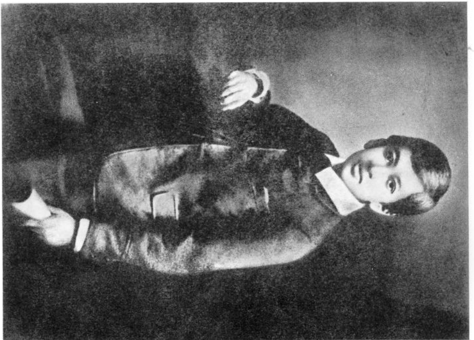
Sri Aurobindo at the age of eleven